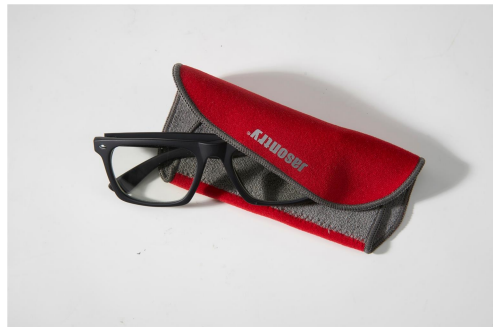
Applying widely used in various fields such as daily life