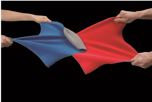
Performing very strong sticky power with soft hand feel

The following items and their applications will be exhibited: