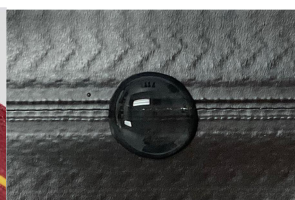
T1 Solid color TPU-SEAL waterproof zipper