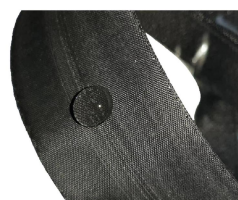
TM1F fabric-like patented TPU-SEAL waterproof zipper